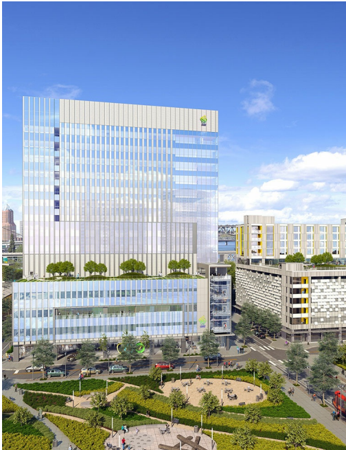
Architectural Renderings: ZGF Architects

Oregon Health & Science University continues its expansion on Portland's South Waterfront with two new multi-story buildings that make up the CHH-S project.