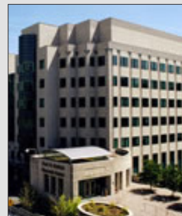
OHSU Hatfield Research Center