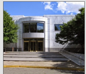
State of Oregon Archive Building