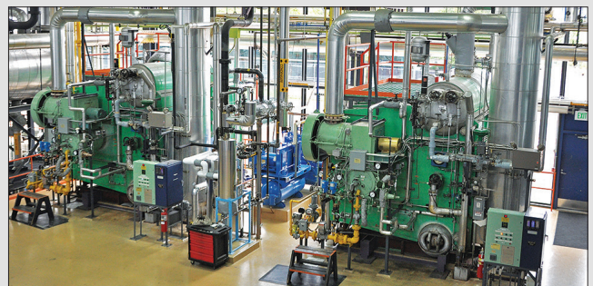
Port of Portland, Central Utility Plant

international recognition regarding the concept of Cx not only as it relates to HVAC and controls, but to other systems such as building envelope, fire and life safety, electrical, water and energy.